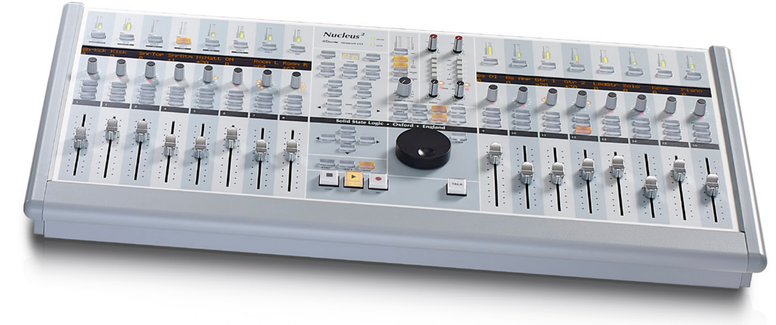
Nucleus2 is available in 'Dark' or 'Light'.